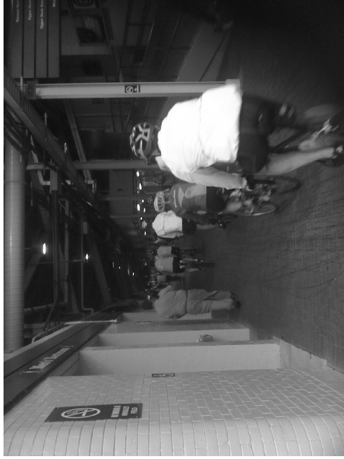
A Wrigley Field Ride Good Enough for Sox Fans September 2010