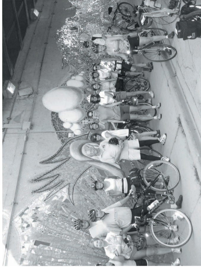
Tour de Tiles Ride, September 2007

THE NEWSLETTER OF THE CHICAGO CYCLING CLUB