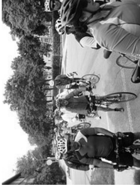
Riders on 2nd annual Southside Architectural Tour in front of Swift Mansion in Kenwood